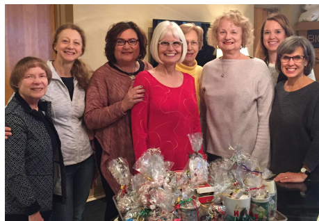
WOW (Women of the Word) ladies class prepares holiday mugs and gifts